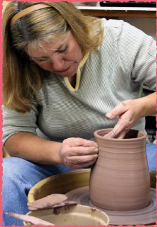
KENTUCKY COMMUNITIES CRAFTS VILLAGE