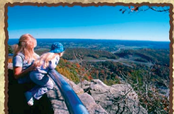
THE PINNACLE OVERLOOK