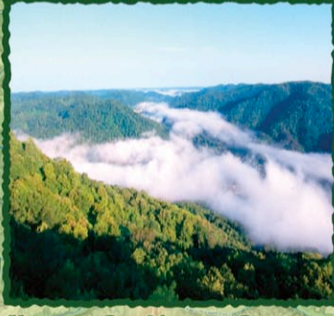
VIEW FROM PINE MOUNTAIN PARK