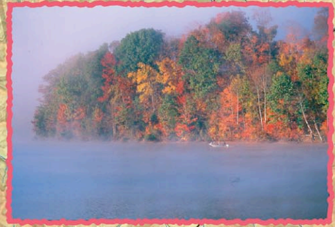
Martin's Fork Lake

KINGDOM COME SCENIC PARKWAY The Parkway is designated a State Scenic Byway on 119