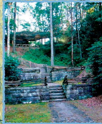
Log Rock in Kingdom Come Park