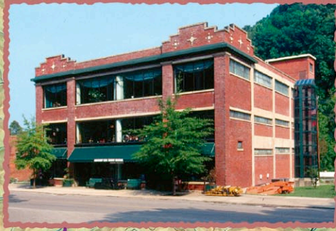
Kentucky Coal Mining Museum