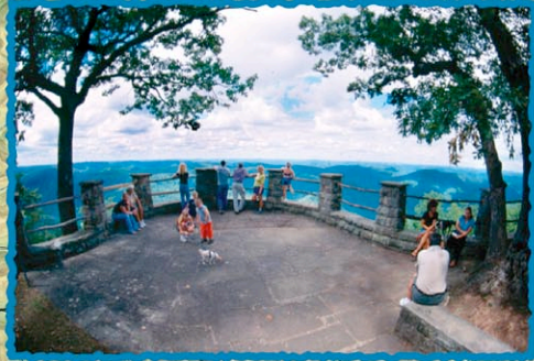
Creech Overlook in Kingdom Come Park